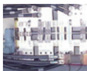
High power switches